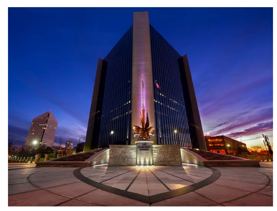
Wichita Federal Credit Union's branch at Wichita City Hall.

The drawback to The Way to Work's early iteration was that it was hard to maintain participants' attention with PowerPoint presentations.